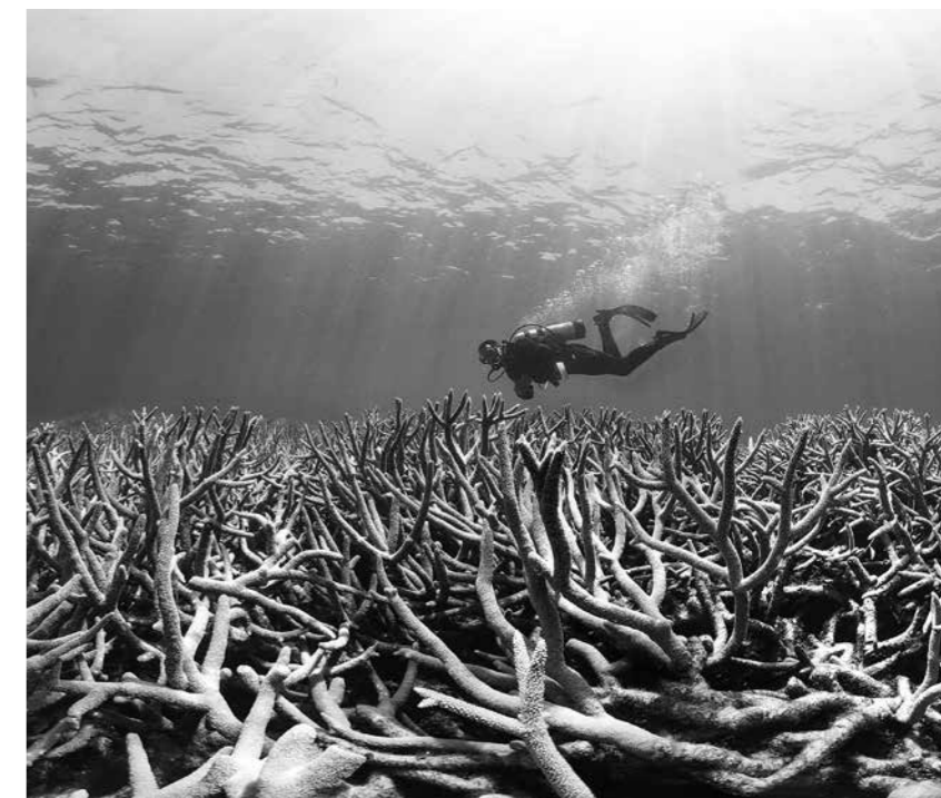
A diver investigates the coral bleaching at Heron Island in February 2016. Located close to the southernmost point of the Great Barrier Reef, this area was one of the first to bleach at Heron Island.

photosynthesis discovery has turned half a century of plant biology on its head. Wheat covers more of the Earth than any other crop, and the discovery may lead to better, faster-growing, better-yielding wheat crops in geographical areas where wheat currently cannot be grown.