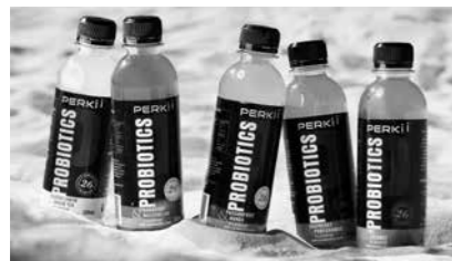
UQ-developed Perkii drinks are now sold in outlets across the country, including Woolworths.