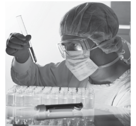
The CRC for Polymers is one of the 13 Cooperative Research Centres in which UQ is an essential or supporting partner.