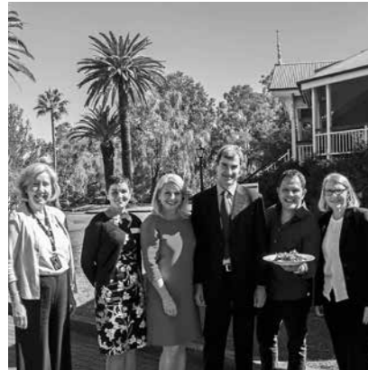
Formerly the Queensland Agricultural College, UQ Gatton celebrated its 120th anniversary in 2017 with a 'Paddock-to-Plate' meal in July celebrating the finest quality produce from the local region. Celebrity chef Alastair McLeod provided a cooking demonstration for approximately 200 staff, alumni, local government and industry representatives; and more than 600 Gatton students joined in the food and music festivities in the Central Walkway.