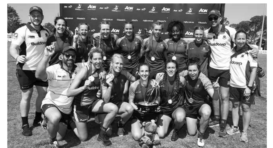
UQ won the inaugural Aon Uni 7s Series, taking victory in all four tournaments and every match of the competition.

A 10-year Development Plan was completed for the Gatton campus. This plan sets out a strategy to realise the University's ambition for the Gatton campus to become Australia's premier plant, animal, veterinary science teaching and research campus and a world-class location for subtropical and tropical agricultural, plant and animal sciences.