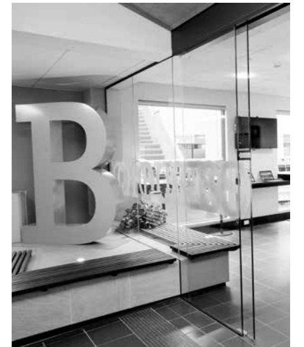
ICTE-UQ worked with UQ Business School Executive Education to deliver a customised Business English program for Chinese executives.

The UQ Symphony Orchestra and the UQ Chorale, joined by selected Brisbane secondary school choirs, performed two concerts at the Queensland Performing Arts Centre Concert Hall in 2017. The May concert