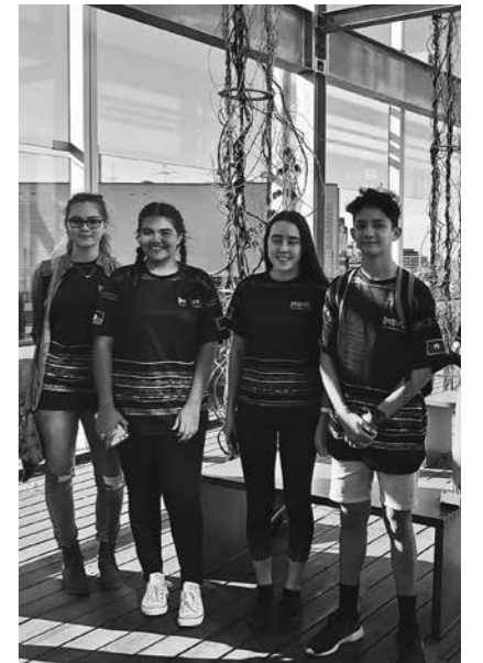
InspireU Law camp participants on the Supreme Court Library and Legal Heritage Centre tour.