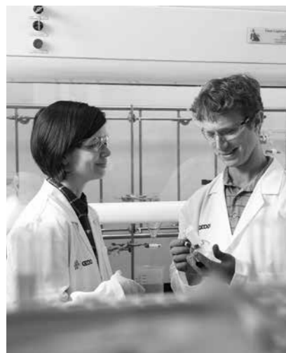
Queensland Emory Drug Discovery Initiative (QEDDI) researchers are currently working on solutions for disease indications including cancer, inflammation and neurodegeneration—topics of discussion at the Queensland-Emory Discovery Symposium held in Brisbane in October.