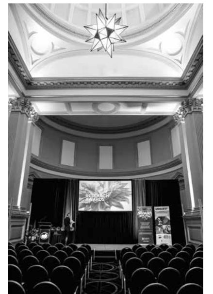
Customs House hosted more than 75,000 guests at more than 800 functions in 2017, one of which was the presentation of the Research Week awards in September.