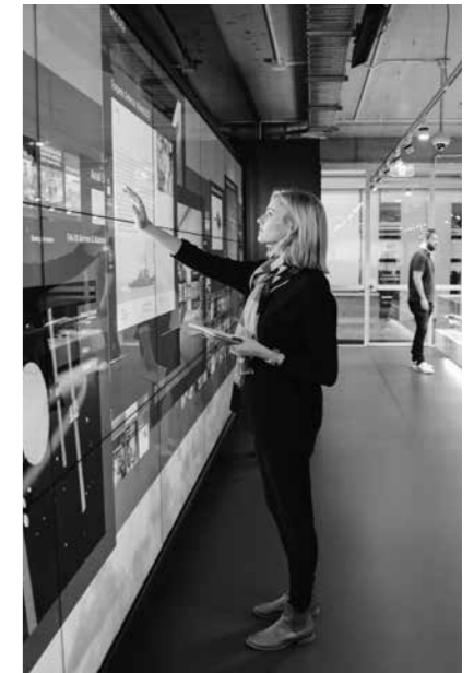
UQ strengthened its partnership with Boeing with the establishment of the Boeing Research and Technology–Australia Technology Centre at the St Lucia campus. Home to around 35 Boeing researchers and technical staff, the Centre also features a high-tech audiovisual and augmented-reality student interaction display area (pictured above), computer labs and collaborative spaces.