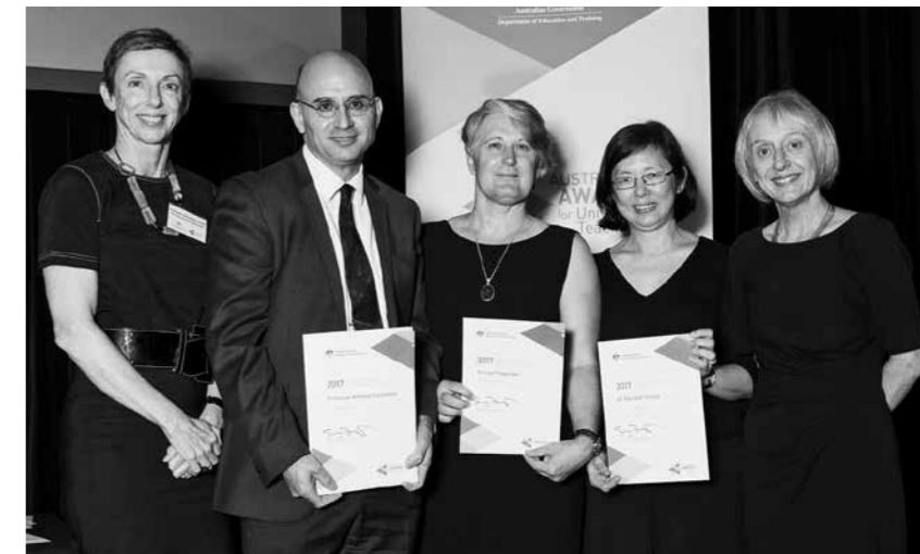
AAUT Awards for Teaching Excellence (Law, Economics, Business and Related Studies)

In 2017, UQ staff were honoured in the Australian Awards for University Teaching (AAUTs), which recognise high-quality teaching and teachers, as well as outstanding contributions to student learning.