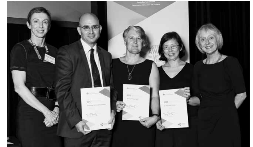
AAUT Awards for Teaching Excellence (Law, Economics, Business and Related Studies)

In 2017, UQ staff were honoured in the Australian Awards for University Teaching (AAUTs), which recognise high-quality teaching and teachers, as well as outstanding contributions to student learning.